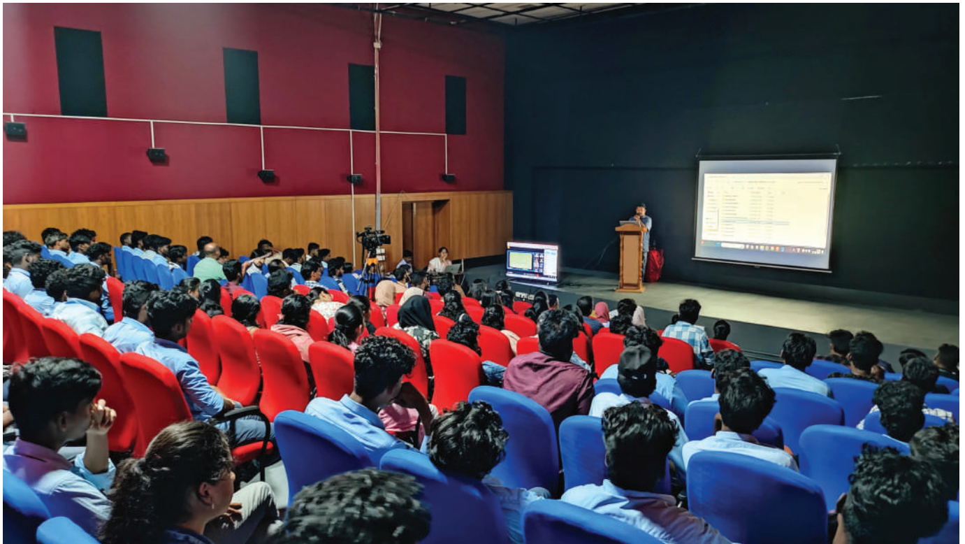
Students attend a workshop on Visual Storytelling and Photojournalism at EMRC Pondicherry ईएमआरसी पांडिचेरी में आयोजित दृश्य कथावाचन (विजुअल स्टोरी-टेलिंग) और फोटो पत्रकारिता कार्यशाला में शामिल प्रतिभागी।

Three Heads of Media Departments and over 180 students from various colleges of Puducherry participated in person along with learners enrolled in the Swayam MOOC on Photojournalism who joined through the online mode.