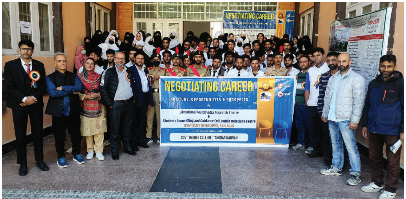
EMRC Srinagar Team organises a Career Counselling Workshop at Govt. Degree College, Tangdar Karnah, Kashmir

The program aims to enlighten the students/aspirants and the wider community in the underserved areas about the university's diverse academic offerings, online education opportunities and recent trends in higher education.