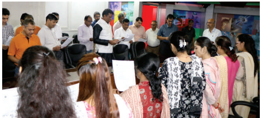
CEC staff members take the integrity pledge सतर्कता जागरूकता की शपथ लेते हुए सीईसी के अधिकारी और कर्मचारी।