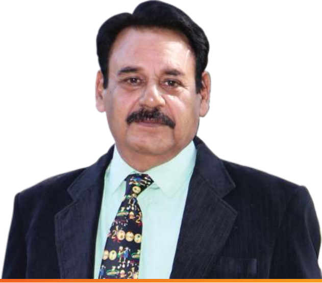
Prof. Jagat Bhushan Nadda