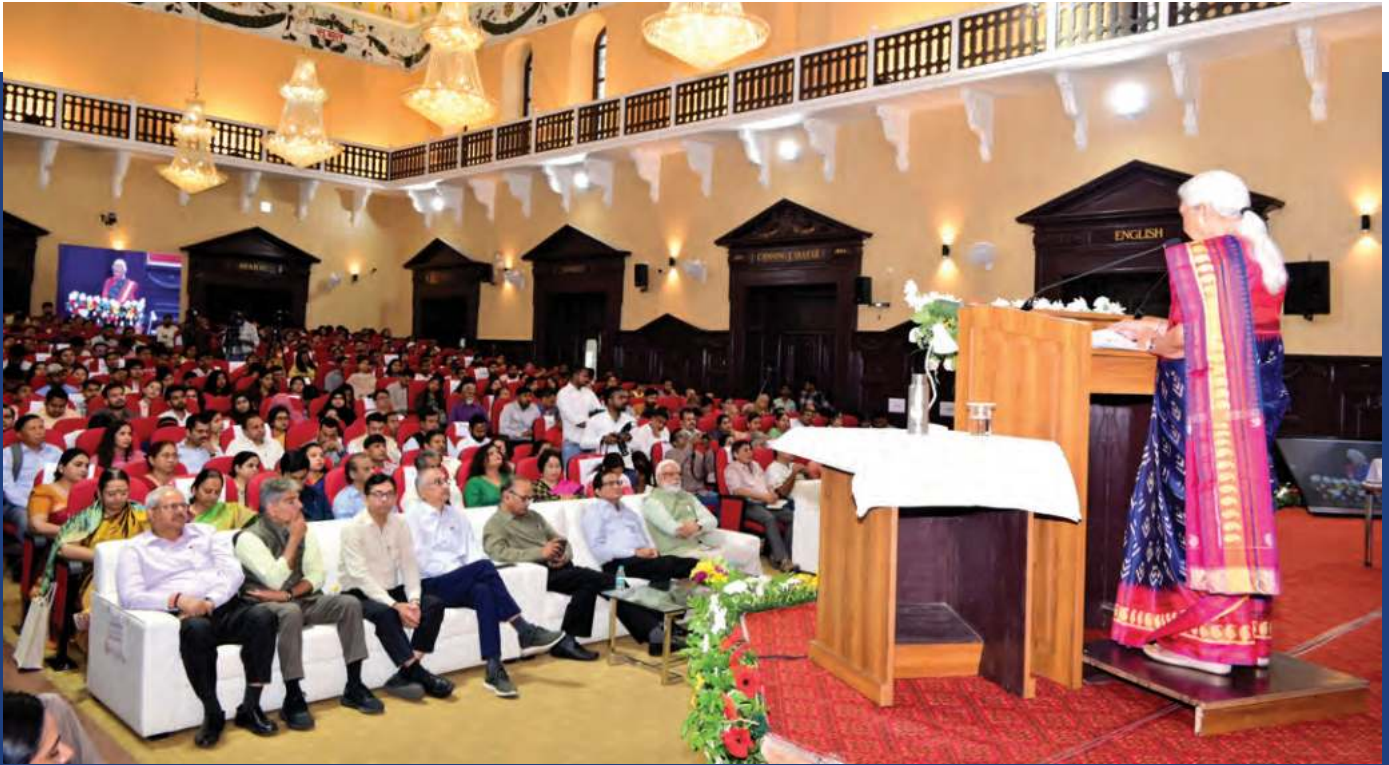
Hon'ble Governor of Uttar Pradesh, Smt. Anandiben Patel addresses the audience at the 26 th CEC-UGC Educational Video Film Festival 26वें सीईसी-यूजीसी शैक्षणिक वीडियो फिल्म महोत्सव में दर्शकों को संबोधित करती श्रीमती आनंदीबेन पटेल, महामहिम राज्यपाल, उत्तर प्रदेश।

उद्घाटन सत्र में प्रो. जे. बी. नड्डा ने दोहराया कि वृत्तचित्र और वीडियो फिल्में शिक्षा के क्षेत्र में क्रांति लाने में समर्थ होने के साथ ही देश के हर कोने तक पहुंच बना सकती हैं। उन्होंने संकाय सदस्यों से डिजिटल शैक्षिक उपकरणों के एकीकरण और कक्षा से बाहर (फ्लिपड क्लासरूम) एवं व्यक्तिगत अभिरुचिपूर्ण शिक्षण जैसी पद्धतियों को अंगीकार करने का आग्रह भी किया।